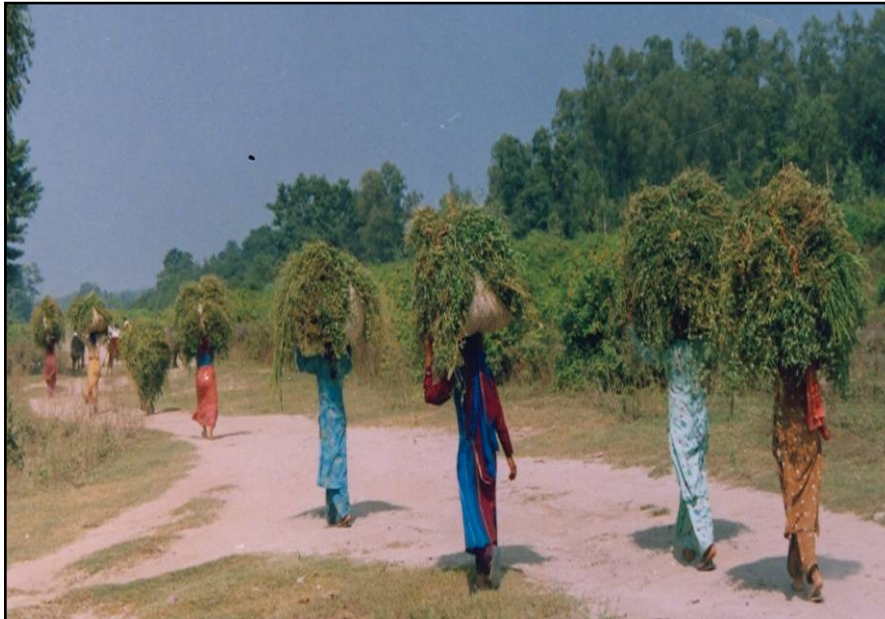
Fig. 2. Women-the main workforce in Uttarakhand

largely comprise women from marginal and small farm households. Project interventions will directly towards poor rural women who have not fully benefited from any other program conducted by other organization and need support for livelihoods.