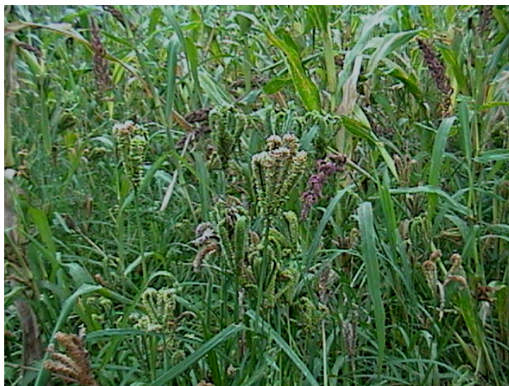
Fig. 3. Millets-food security in mountains

Role of women folk is crucial and considered as back bone for hill agriculture pattern. Women are responsible for all agriculture operations ranging from field preparation, sowing, weeding, harvesting and supporting men and concern person ploughing the field. It has been monitored that maximum work load have been performed by women in the mountain region. Less agriculture facilities, modern agrotechnology, migration of local youth are factors responsible for low crop productivity.