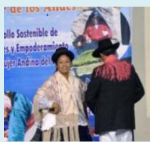
Entertainers from 2012 Conference in Peru