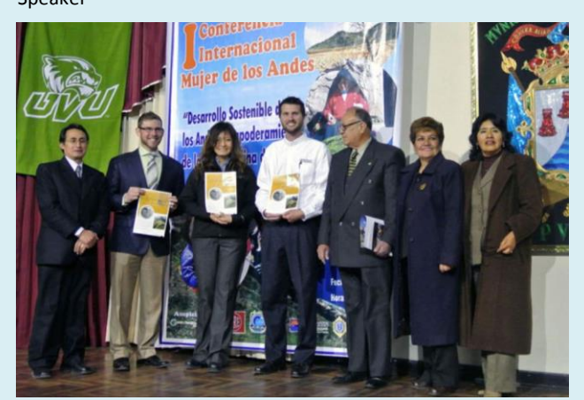
2012 Women of the Mountains Participants