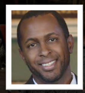
Amir Law Diversity Office