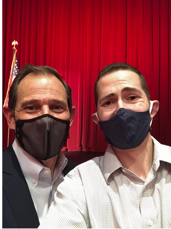
Congressman John Curtis (left) and myself (right)

Utah International Mountain Forum works closely with the office of Congressman John Curtis and the elected official as well: several of our members interned at his office both in Utah and in Washington, D.C. and kept him informed about activities of UIMF to advocate for sustainable mountain development (SMD) in Utah and elsewhere and the State of Utah as one of the promising models of SMD. Congressman famously spoke on the floor of the United States House of Representatives about UIMF efforts to promote SMD at the United Nations and High-Level Political Forum on Sustainable Development in September 2018. Taking into account strong interest of Congressman Curtis to the sustainable development of rural areas in the State of Utah, I was able to briefly speak to Congressman Curtis and inform about the most recent UIMF activities. He remembered me from previous interactions and was happy to see me