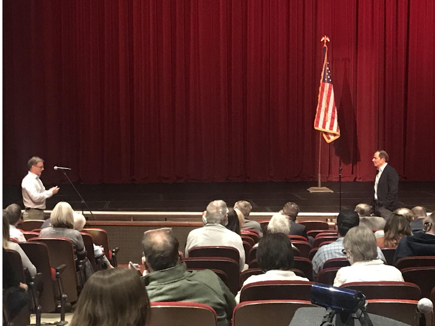
Congressman Curtis answers questions from constituents

Although numerous important issues were raised, for the purpose of this narrative, we will focus solely on the portions regarding environmental concerns. Congressman Curtis is passionate about the environment, and is a self-proclaimed “climate conservative.” He believes that Republicans also care about the environment, but do not want to be associated with the negative stigma that follows the words, ‘climate,’ or ‘environment.’ Therefore, they avoid engaging in this topic. Consequently, Conservatives are then left out of the decision process and advocacy efforts have become partisan. Yet, the earth is something that we can and should all care about. Free of the political and societal presumptions and biases, on its face value it is something that everyone wants. It is indisputable basic human psychology that we like things that are orderly, clean, fresh, and beautiful.