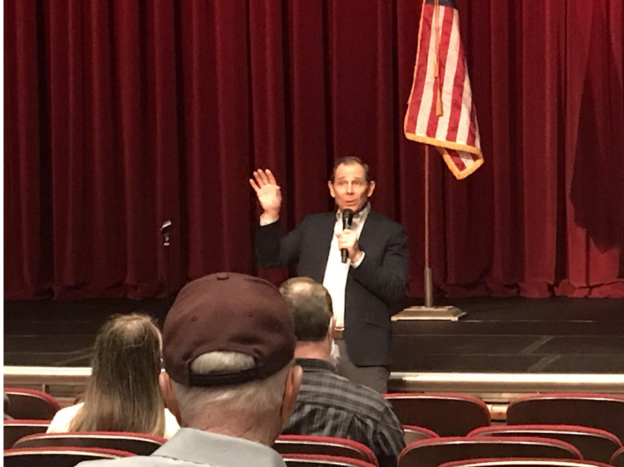
Rep. Curtis addresses the audience

Congressman Curtis began by saying that Utah loves the environment. He is certain that this is an important issue to many here in the beehive state, and that we are a great example. He spoke of how the scenery of the mountains as a young scout made such an impression on him that he carries to this day. He explained, while science and data are very important, the real motivator for environmentalism is emotional connection.