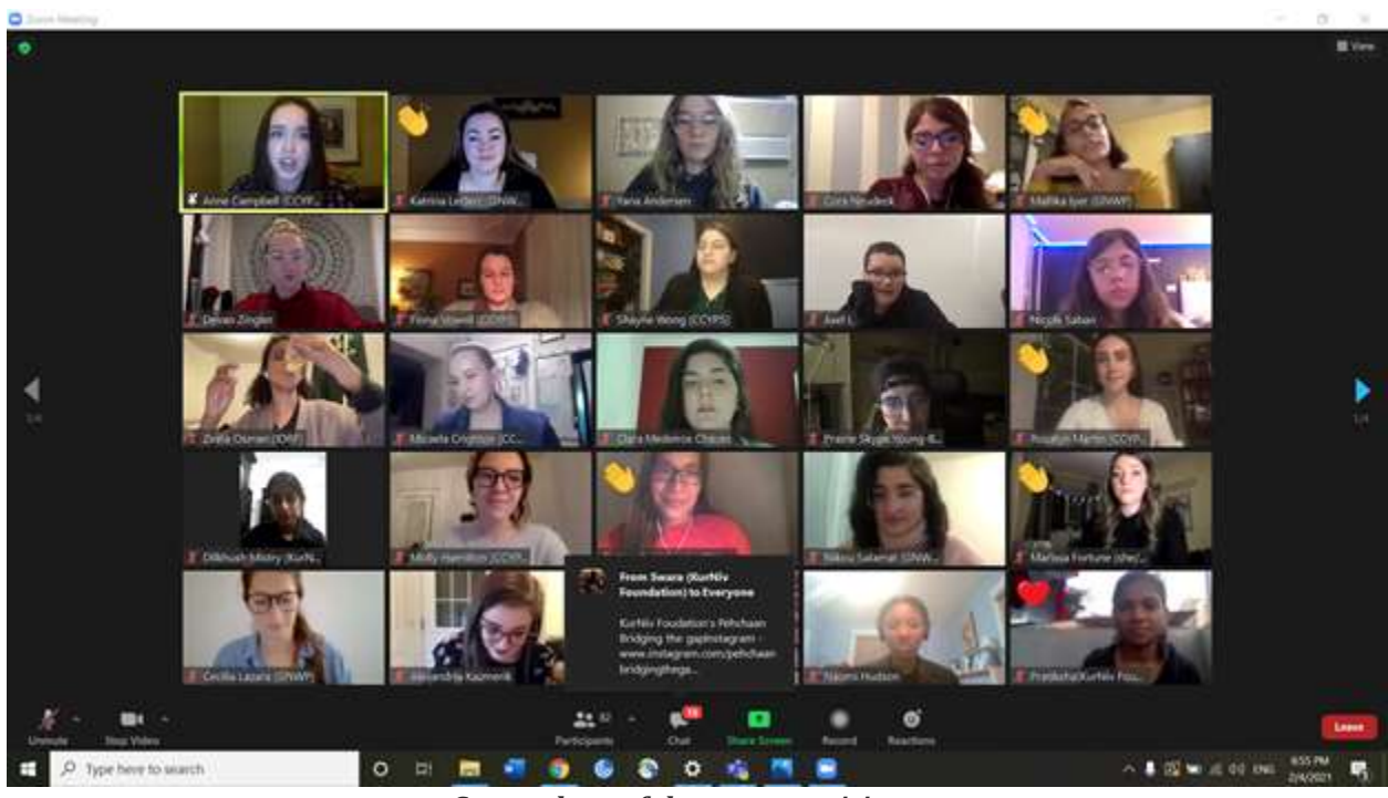
Group photo of the event participants

On Thursday, February 4th, 2021, I represented UVU Rotaract as the President and as a member of the Utah International Mountain Forum (UIMF), a coalition of student clubs at Utah Valley University (UVU), as I gathered with young adults from all over the world who joined virtually for a United Nations 65th Commission on the Status of Women (CSW) Youth Preparation Event (YPE). This YPE was set up as a lecture workshop with the goal to help youth become effective advocates in international fora. The event was hosted by Canada Youth for Peace(CYP), a nongovernmental organization who seeks to involve youth in social advocacy work.